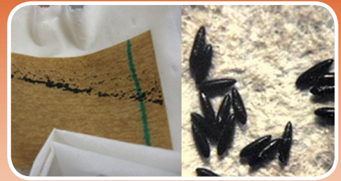
Eggs look like black dirt.

For more information on mosquitoes and dengue, visit: www.cdc.gov/dengue