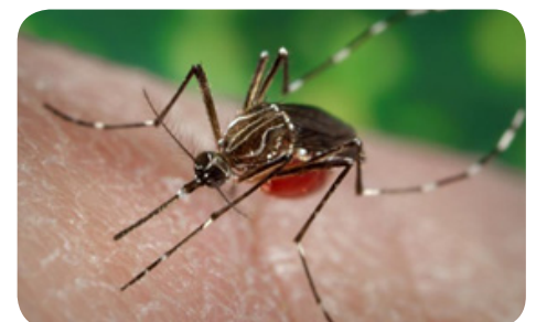
Female mosquito after biting a person.