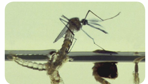
Emerging adult mosquito.