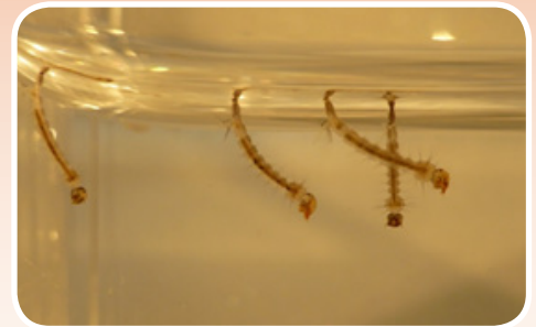
Larvae in the water.