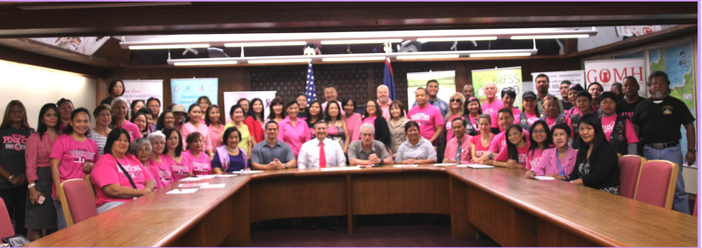
Proclamation Signing with Governor Eddie Baza Calvo

Breast Cancer Awareness Month activities kicked off on October 2, 2013 with a Proclamation Signing with Governor Eddie Baza Calvo. In addition to community partners, numerous survivors and caregivers attended to mark the special occasion. In an effort to increase the number of women screened for breast cancer, Guam Regional Medical City, in partnership with the American Cancer Society, the Department of Public Health and Social Services' Breast and Cervical Cancer Early Detection Program, PMC Isla Health System, FHP and Guam Radiology Consultants partnered to offer a $25 gas coupon to women upon completion of an initial mammogram. The incentive promotion ran through the end of December and reached 200 women.