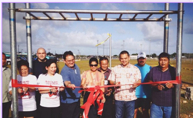
Dignitaries, guests and members of the NCD Physical Activity Group and CCC Prevention Action Team during the Ribbon Cutting Ceremony to open the 5- Course Exercise Station at the Northern Sports Complex on January 15, 2014