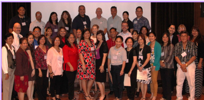
Guam Comprehensive Cancer Control Coalition Members

Thank you to all DRAT and other Coalition members who have helped further our work. If you have the interest and time, please join us at our monthly meetings - 3rd Tuesday of each month at the UOG Dean Circle House #7 from 9am-10am.