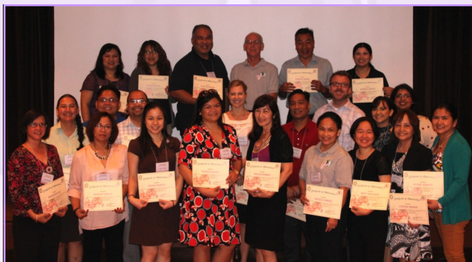
GCCC Coalition Active Members at the Annual Cancer Retreat held on December 13, 2013 at the Westin Resort Guam