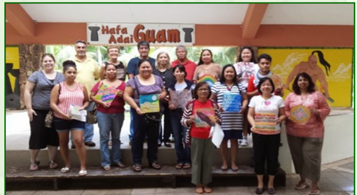
Caregiver Support Group

As of the 2006 Reauthorization of the Older Americans Act, the following specific populations of family caregivers on Guam are eligible to receive services: