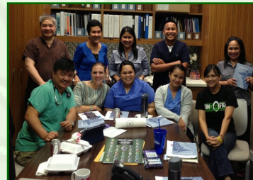
Health Partners LLC.