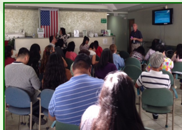
The Doctor's Clinic