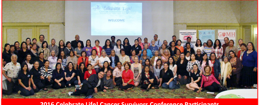
2016 Celebrate Life! Cancer Survivors Conference Participants

The Guam Comprehensive Cancer Control Coalition's Survivorship and Quality of Life Action Team hosted the annual Celebrate Life! Cancer Survivors Conference held on September 24<sup>th</sup> at Pacific Star Resort & Spa. The conference is intended for all those living with, through and beyond a cancer diagnosis.