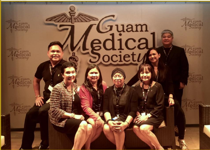
GCCC Coalition Steering Committee members at the Guam Medical Society's 8th Micronesians Medical Symposium held on Nov. 6, 2016, The Westin Resort Guam