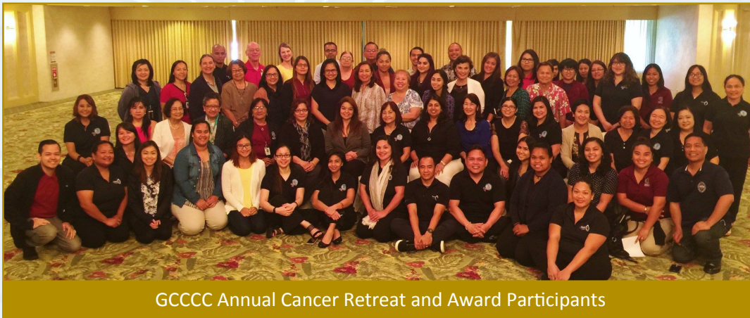
GCCCC Annual Cancer Retreat and Award Participants