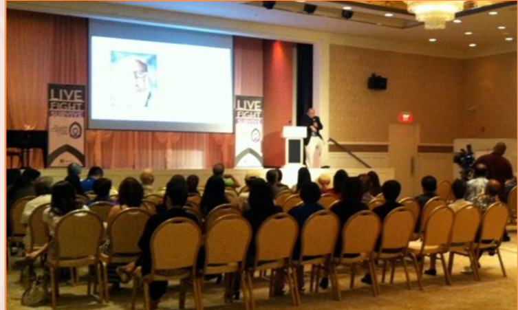
It Is Time Cancer Forum: A Dialogue on Cancer Screening and Prevention

Many of the providers expressed interest in conducting this form of dialogue, along with actual testimonies from cancer survivors and caretakers, as they believe this would be beneficial and a better way to inform the community in regards to cancer screening and prevention.