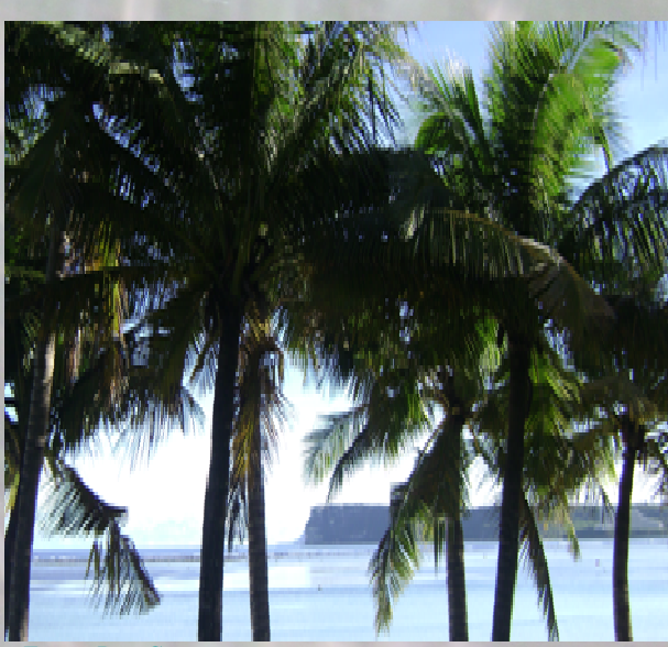
Tumon Bay, Guar