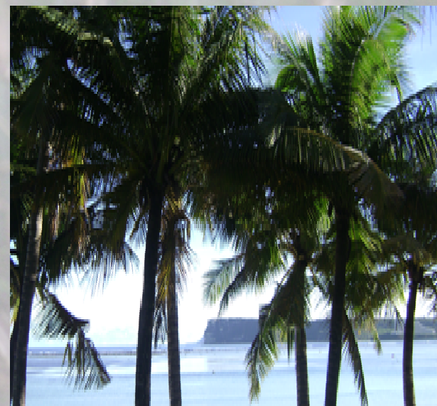
Tumon Bay, Guam