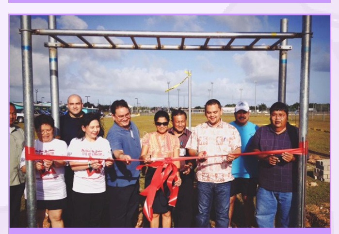
Dignitaries, guests and members of the NCD Physical Activity Group and CCC Prevention Action Team during the Ribbon Cutting Ceremony to open the 5- Course Exercise Station at the Northern Sports Complex on January 15, 2014