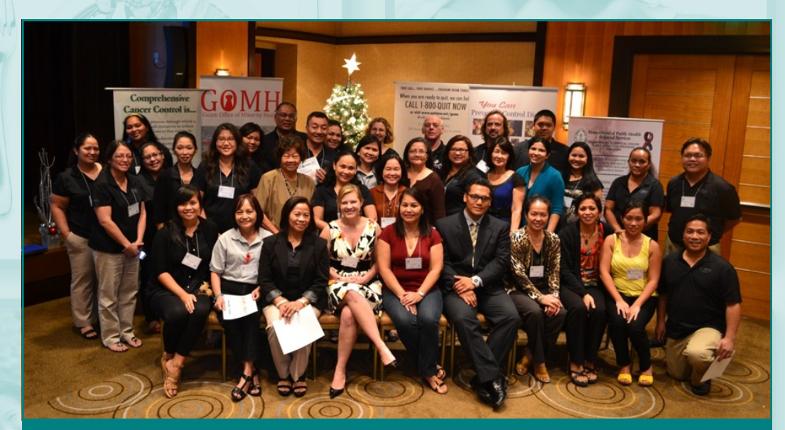
Guam Comprehensive Cancer Control Coalition members at the Annual Cancer Retreat held on December 14, 2012 at the Westin Resort Guam

We encourage you to join our coalition as we continue to prevent and control cancers in our community. This newsletter highlights several of our accomplishments so far this year and we hope to accomplish more in the months to come.