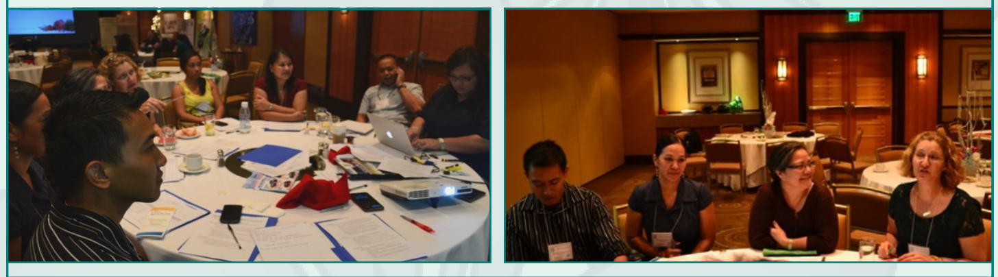
Guam Comprehensive Cancer Control