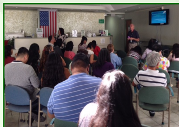
The Doctor's Clinic