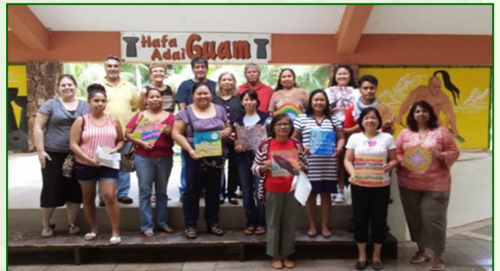
Caregiver Support Group

Since 2011, NFCSP has been housed under Health Services of the Pacific and liaises with other island programs and agencies to help provide care for the family caregiver on Guam. For more information on how you, a friend or family can receive services, please contact us at 735-3277 or check us out on Facebook: www.facebook.com/NFCSP .