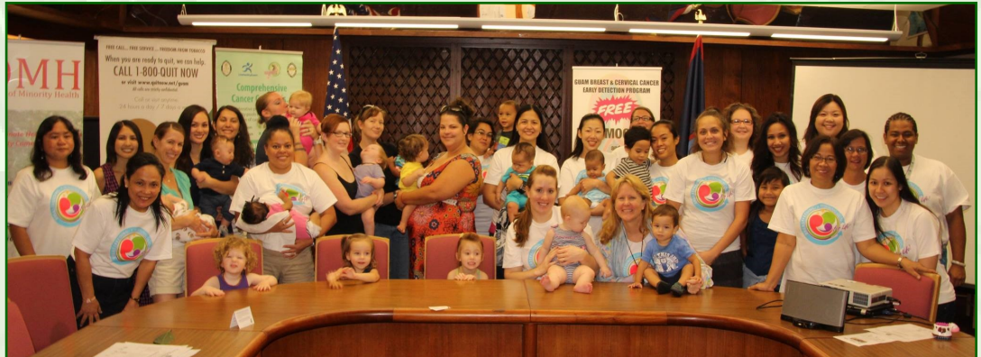
Proclamation Signing at the Governor's Office

Maternal benefits of breastfeeding extend passed childbearing age. In some studies, breastfeeding has been associated with reduced risk of ovarian cancer and pre-menopausal breast cancer 62 . It has been shown that breastfeeding longer time periods (up to 2 years) and among younger mothers (early twenties) may reduce risk of pre-menopausal breast cancer and possibly post-menopausal breast cancer. In addition, the risk of ovarian cancer 61 may be lower among women who have breastfed their children. Mothers who breastfed had experience less postpartum bleeding and earlier return to pre-pregnancy weight.