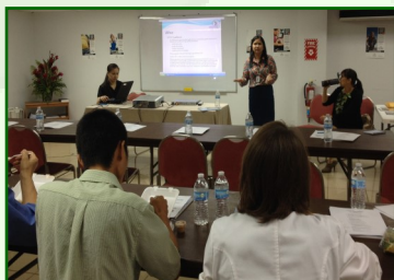
Seventh Day Adventist

The 2014 USPSTF Screening Guidelines is now available for download at www.uspreventiveservicestaskforce.org .