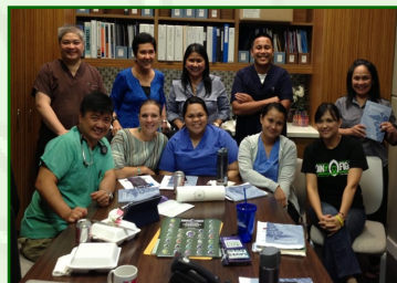
Health Partners LLC.