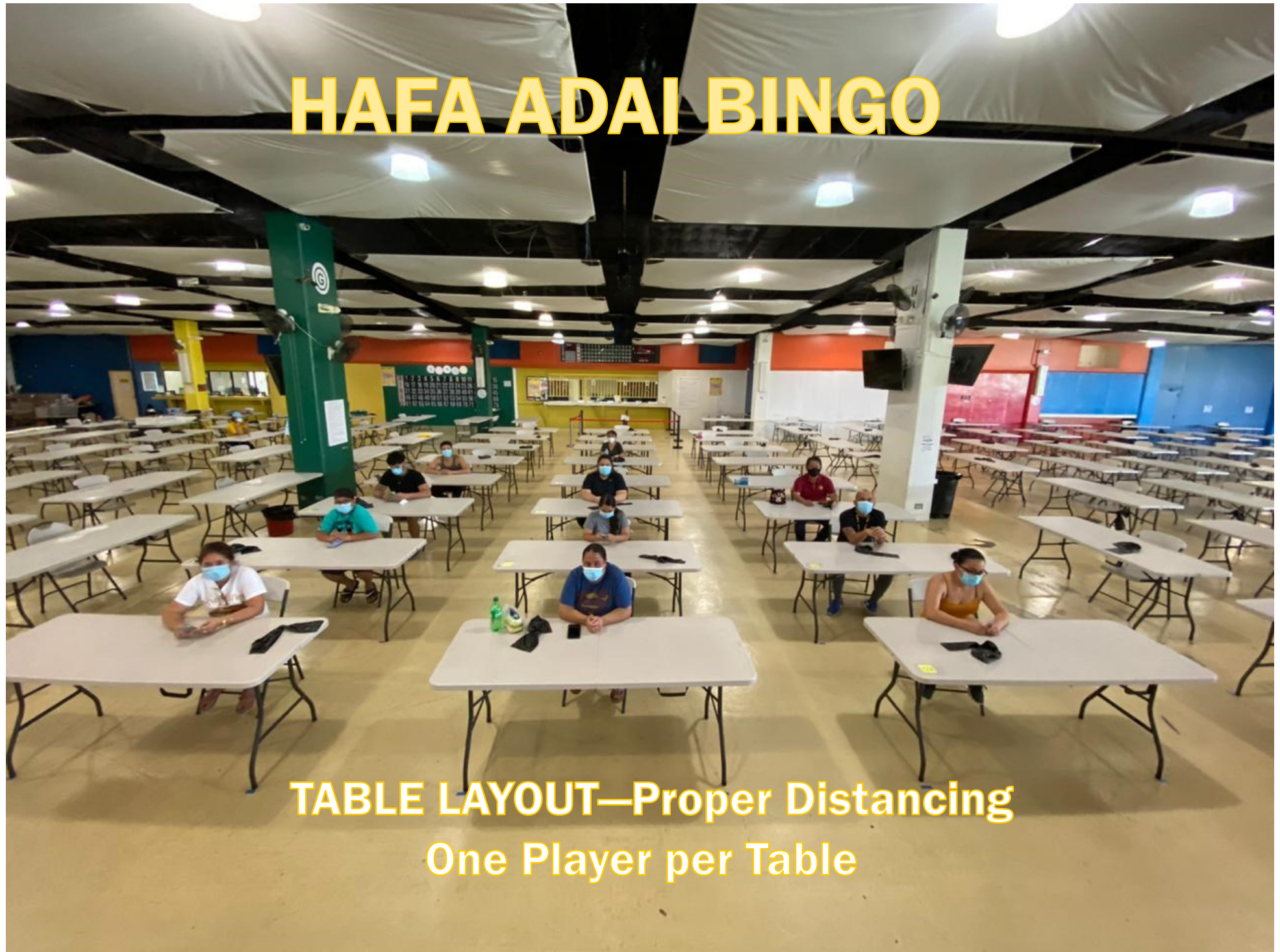
TABLE LAYOUT—Proper Distancing One Player per Table