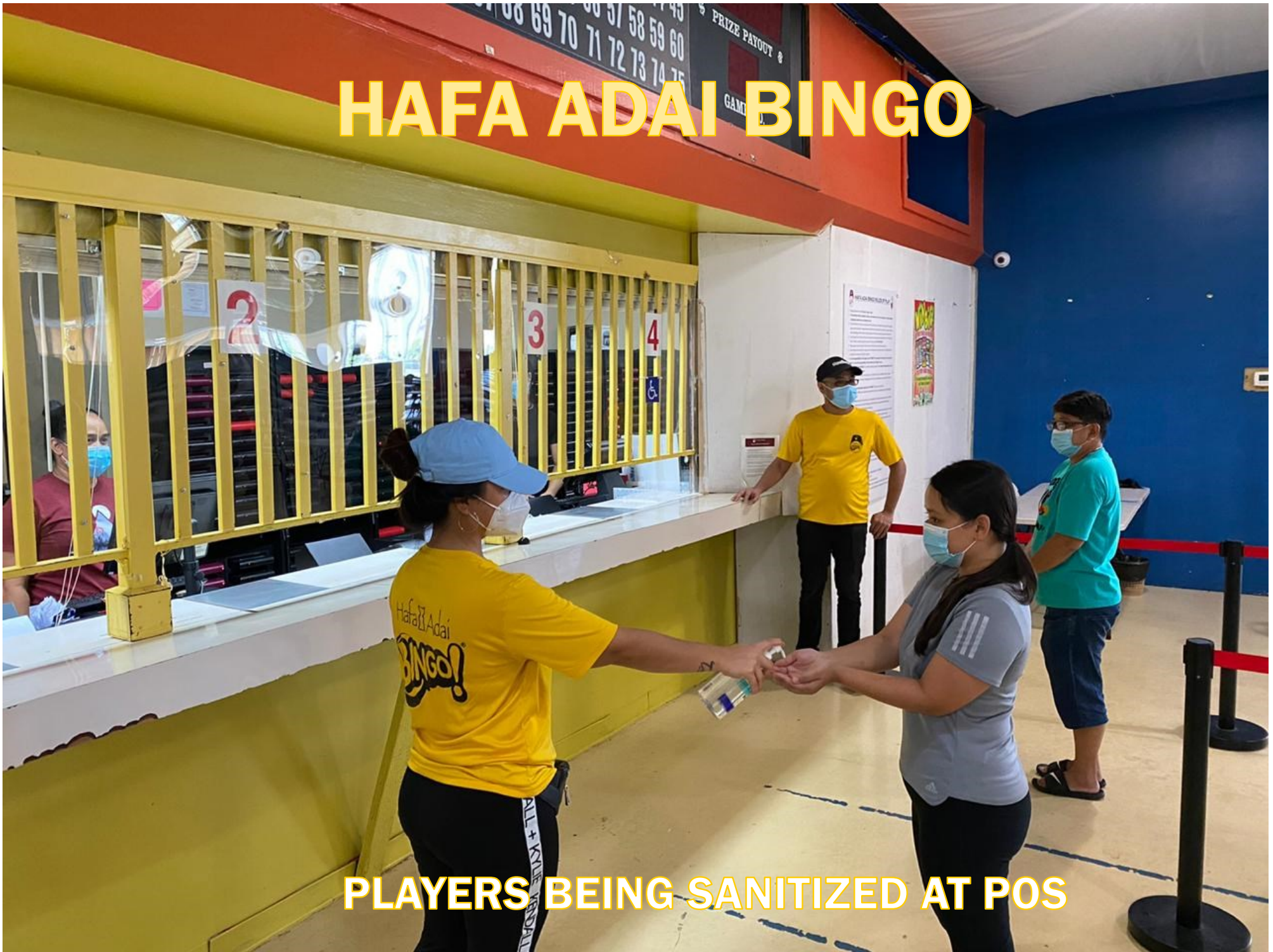
PLAYERS BEING SANITIZED AT POS