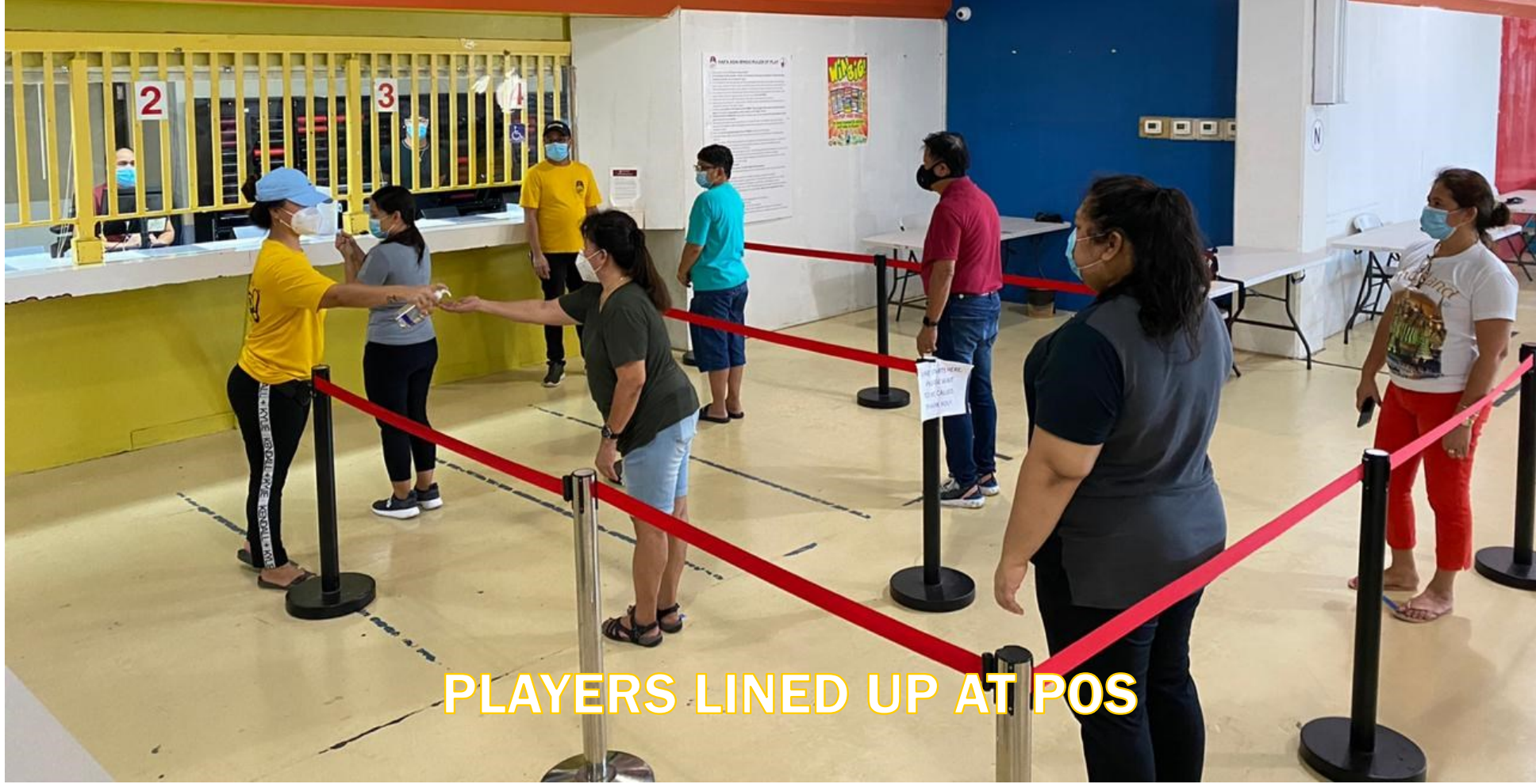
PLAYERS LINED UP AT POS