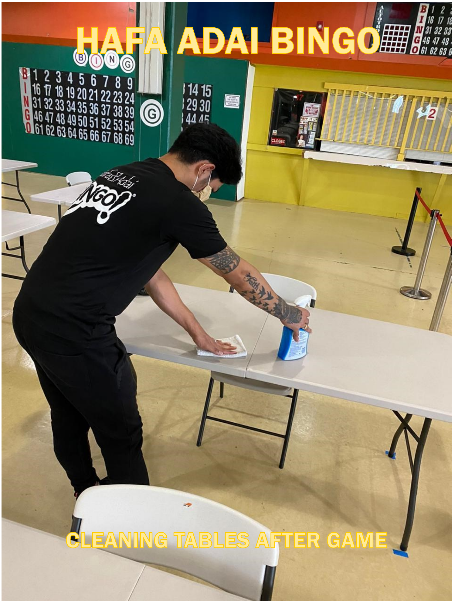
CLEANING TABLES AFTER GAME