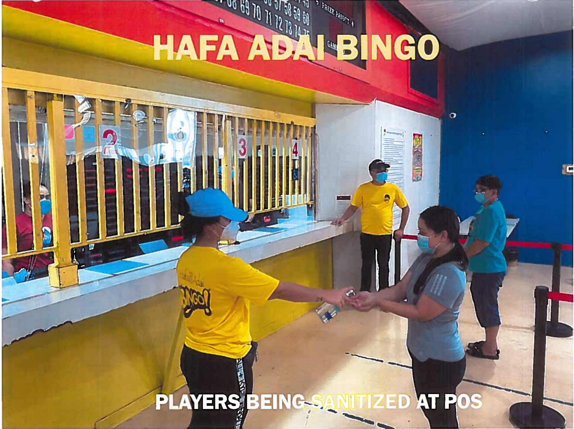
PLAYERS BEING SANITIZED AT POS