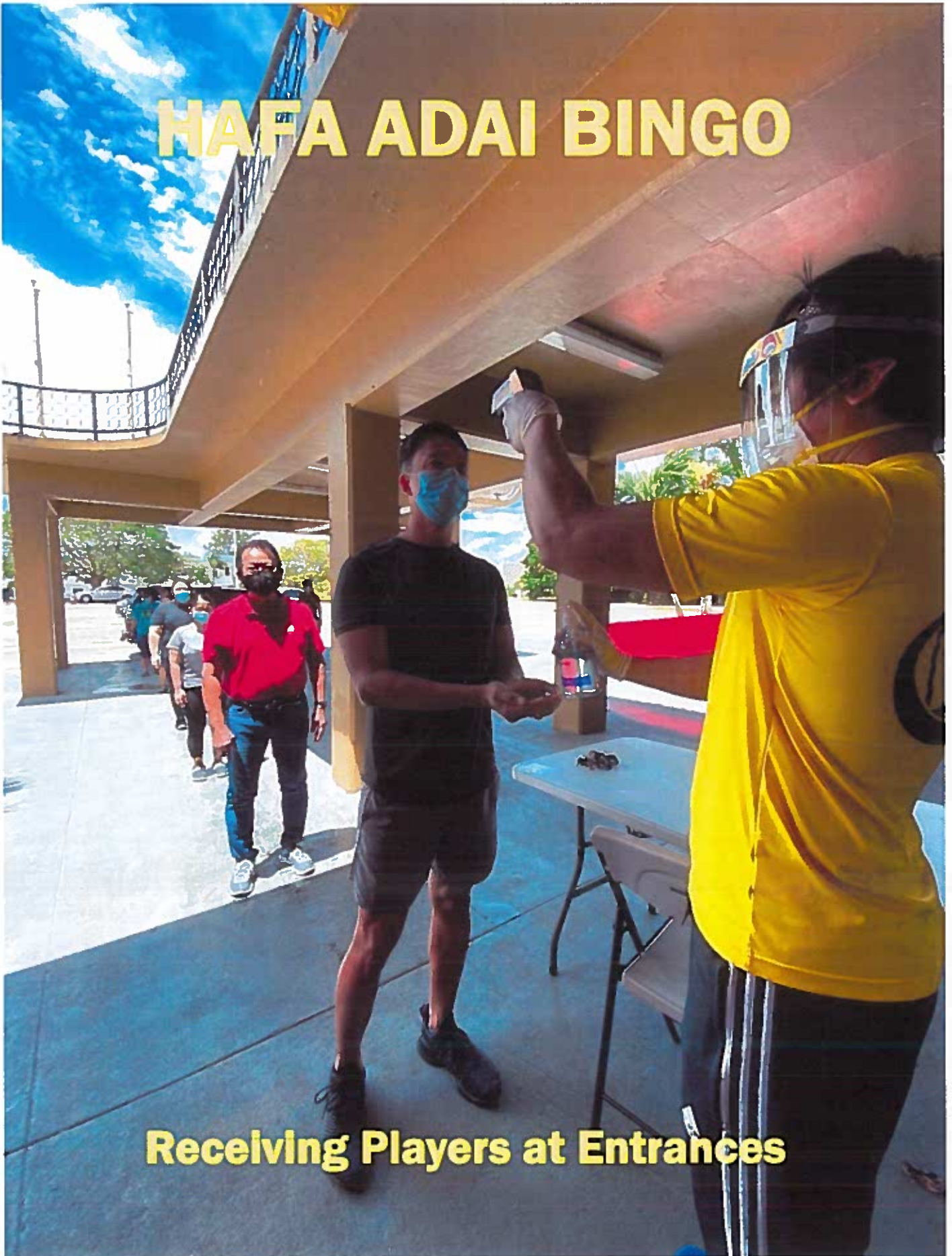
Receiving Players at Entrances