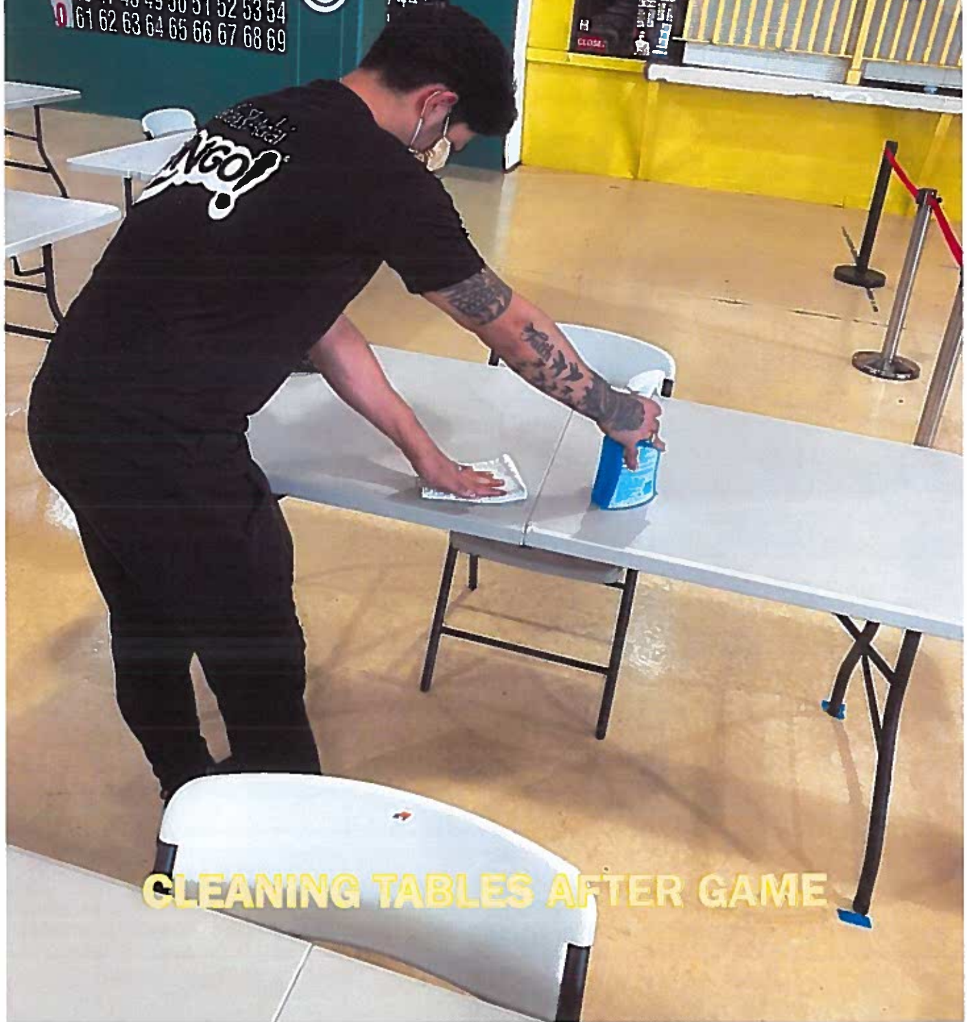
CLEANING TABLES AFTER GAME