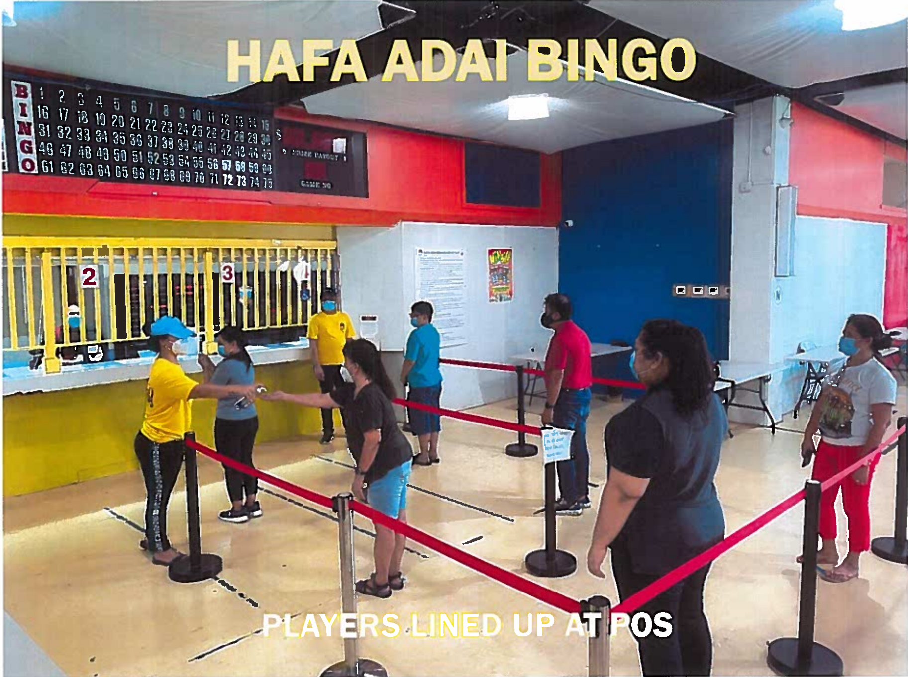
PLAYERS LINED UP AT POS