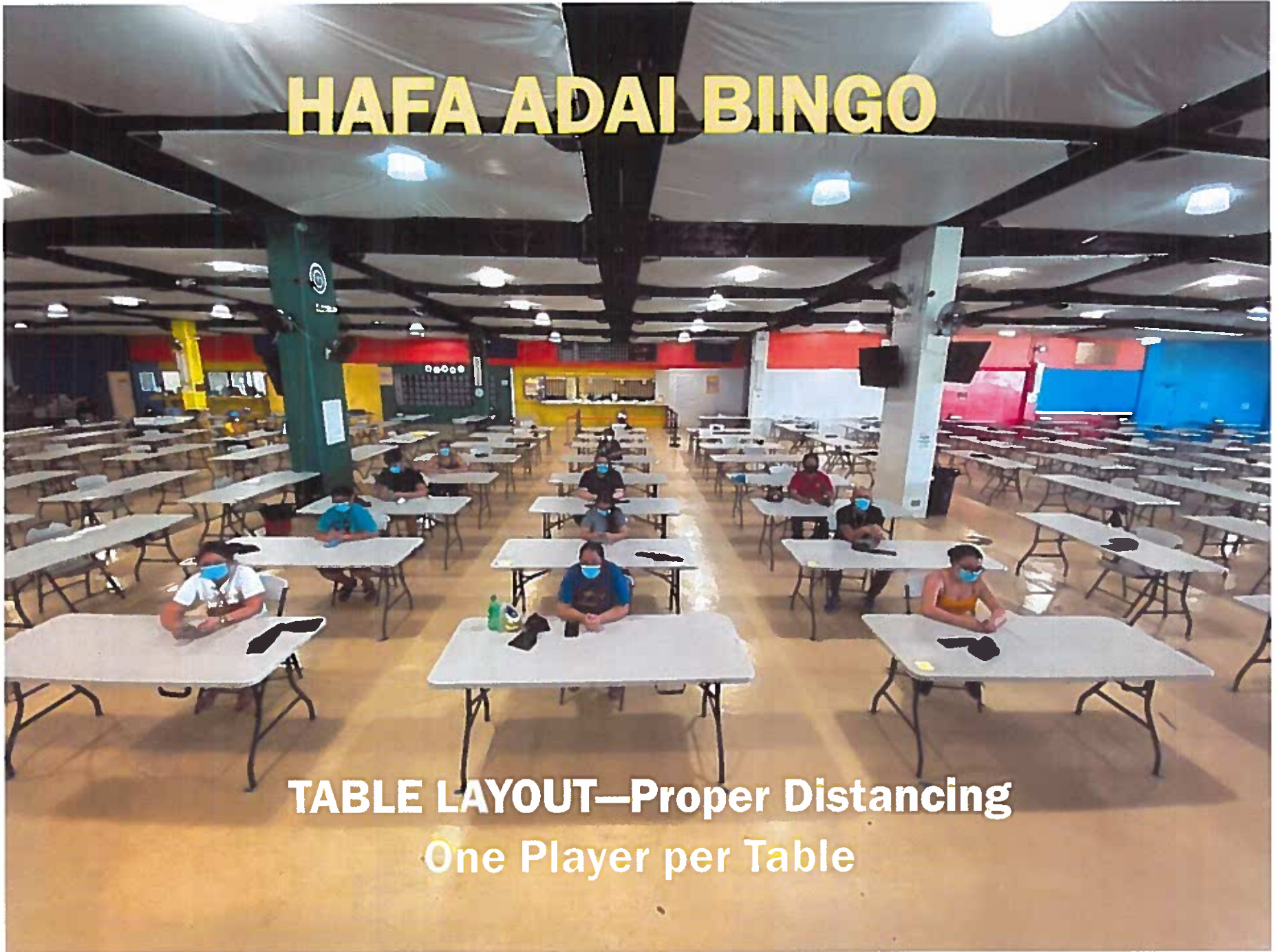
TABLE LAYOUT—Proper Distancing One Player per Table